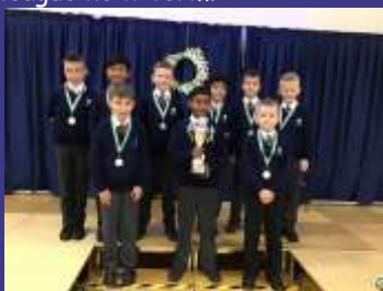
Three players were absent for the photo.

Thank you to the parents for transporting the children to the matches and for supporting the team! We are looking forward to the girls football league next term!